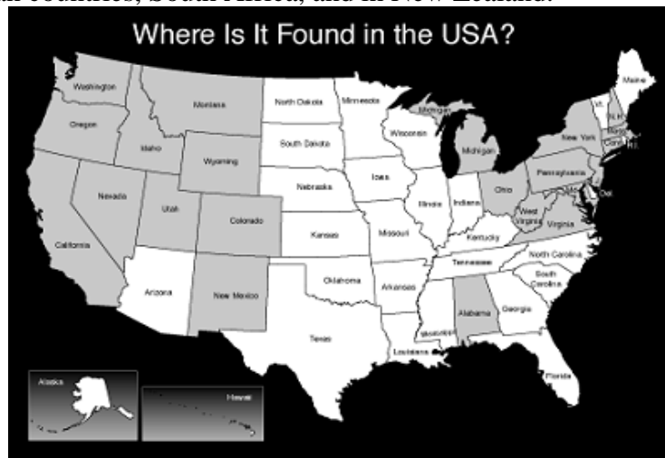
Distribution map borrowed from www.protectyourwaters.net

DISTRIBUTION: Whirling disease is native to the Eurasian continent. However, through fish transfers whirling disease is currently found in 22 states: Alabama, California, Colorado, Connecticut, Idaho, Maryland, Massachusetts, Michigan, Montana, Nevada, New Hampshire, New Jersey, New Mexico, New York, Ohio, Oregon, Pennsylvania, Utah, Virginia, Washington, West Virginia and Wyoming. It is also in several European countries, South Africa, and in New Zealand.