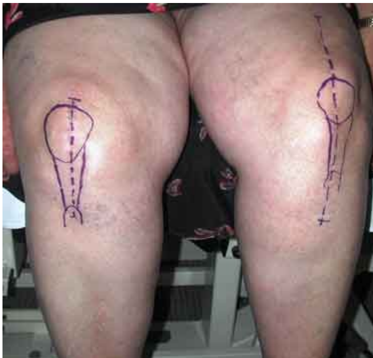
Photo showing a standard TKR incision on patient's left knee (by another surgeon) and minimally invasive incision TKR by Mr Jari on patient's right knee

The minimally invasive approach to the total knee replacement is appropriate for most patients who have reasonable motion without significant deformity. Hospitalization is usually reduced to one to three days among these patients, and the need for an extended stay for inpatient rehabilitation may be reduced or eliminated in most patients.