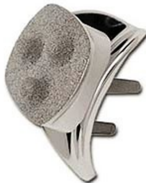
A patellofemoral joint replacement

The "uni," as it is commonly called, is used to replace a single compartment of the arthritic knee. The knee joint has three compartments: the medial (inner) compartment, the lateral (outer) compartment and the patellofemoral (kneecap) compartment. If the damage is limited to either the medial or lateral compartment, that compartment may be replaced with the uni. If the damage is limited to the patellofemoral compartment, an isolated patellofemoral replacement can be undertaken.