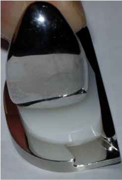
Picture of a unicompartmental knee replacement

The designs of the unicompartmental types of knee replacements have improved over the years, as has the sophistication of the instruments used to implant these types of artificial joints. The unicompartmental knee replacement also has smaller, less invasive incisions.