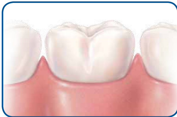
Healthy teeth and gums

The check-up should also include your tongue, throat, face, head, and neck. This is to look for any signs of trouble, swelling, or cancer.