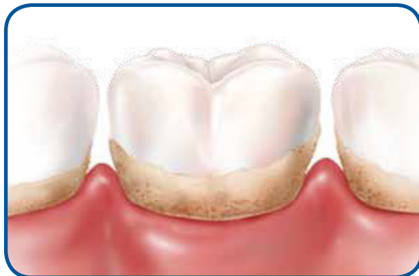
Plaque and tartar buildup