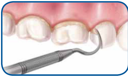
Scaling removes plaque and tartar

Brushing and flossing help clean the plaque from your teeth, but you can't remove tartar at home. During the cleaning, your dental professional will use special tools to remove tartar. This is called scaling .